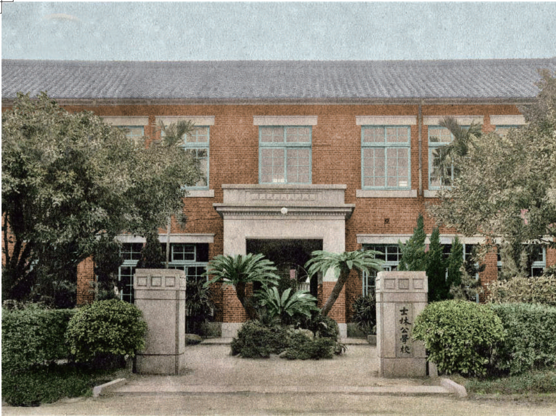
The Canal used to flow pass the main entrance of Shilin Elementary School