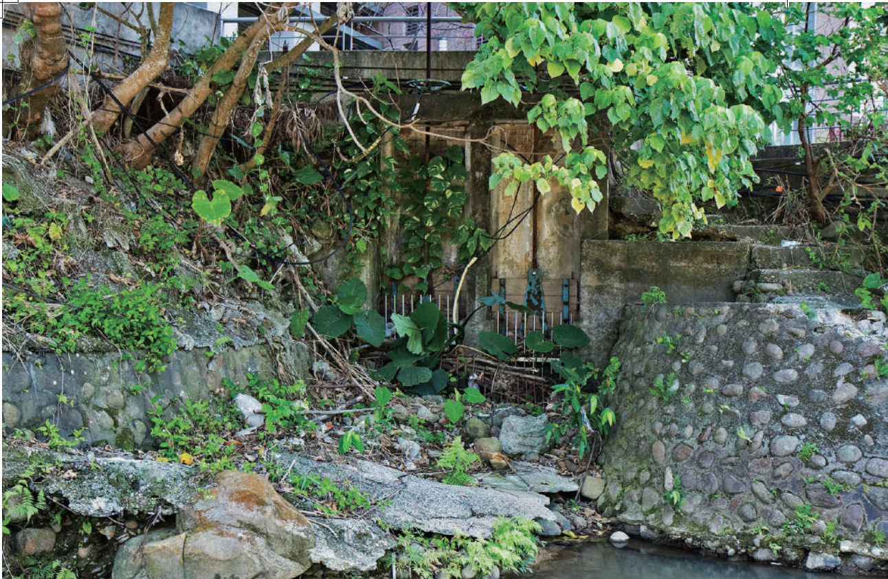
Past scene of the intake of Fudeyang Canal