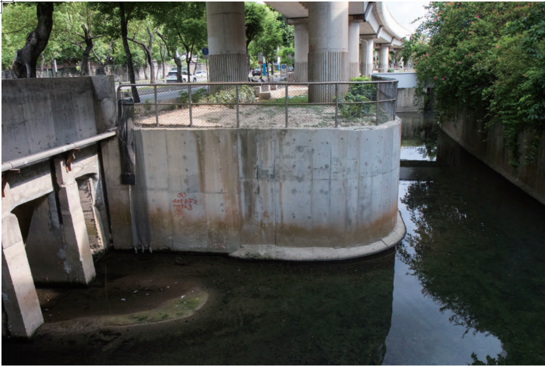
Fudeyang Canal flows through Zhongshan North Road