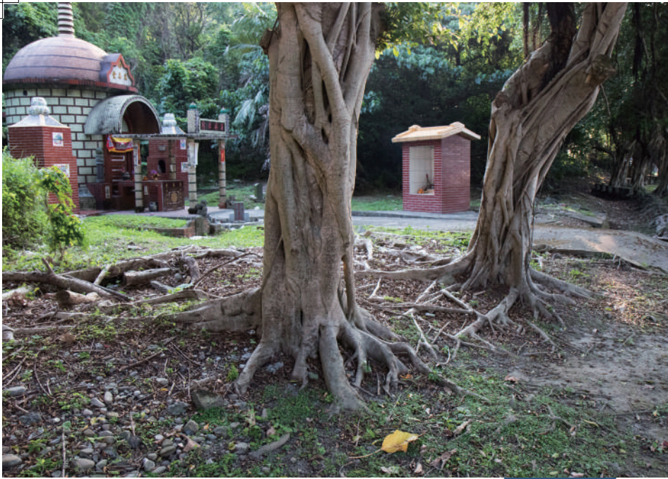
Linzakou Wanshan Hall and the canal