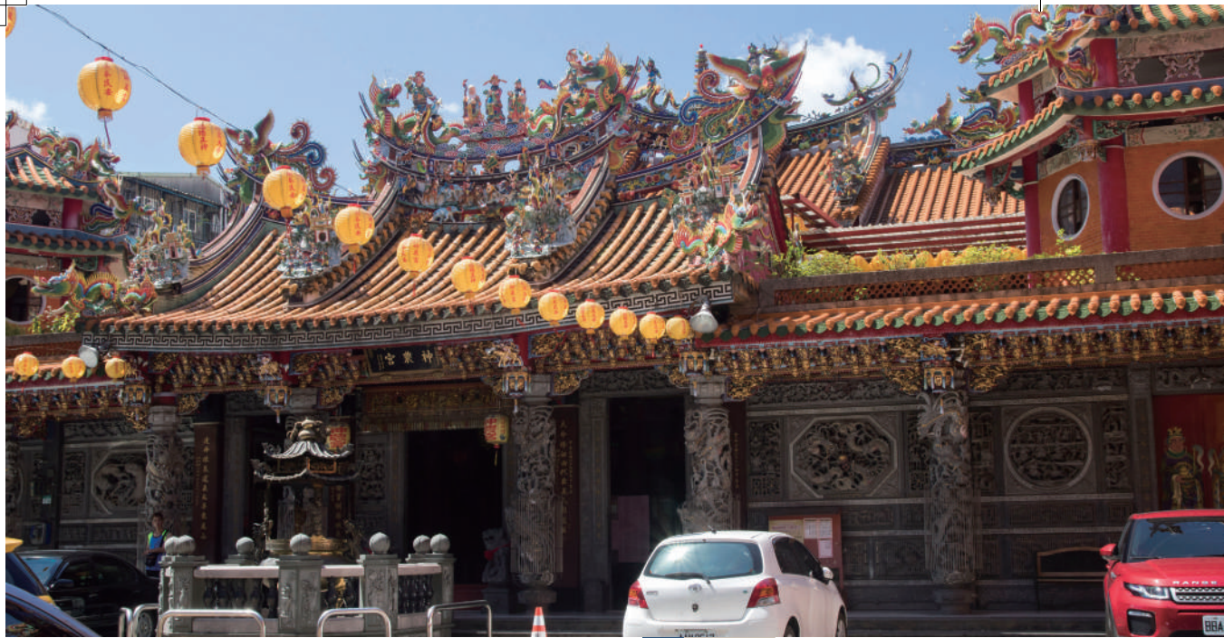
The Shennong Temple