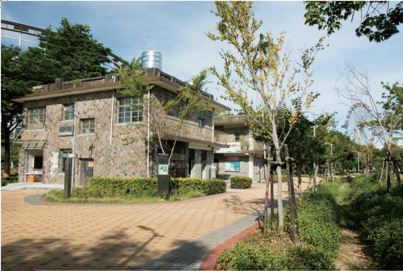
The stone house and the dry canal at Meilun Park