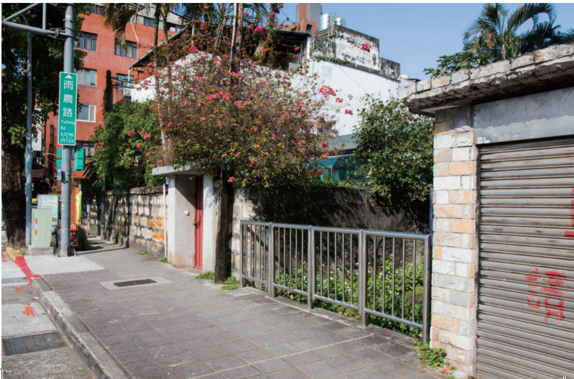
The northern main line passes through Yunong Road