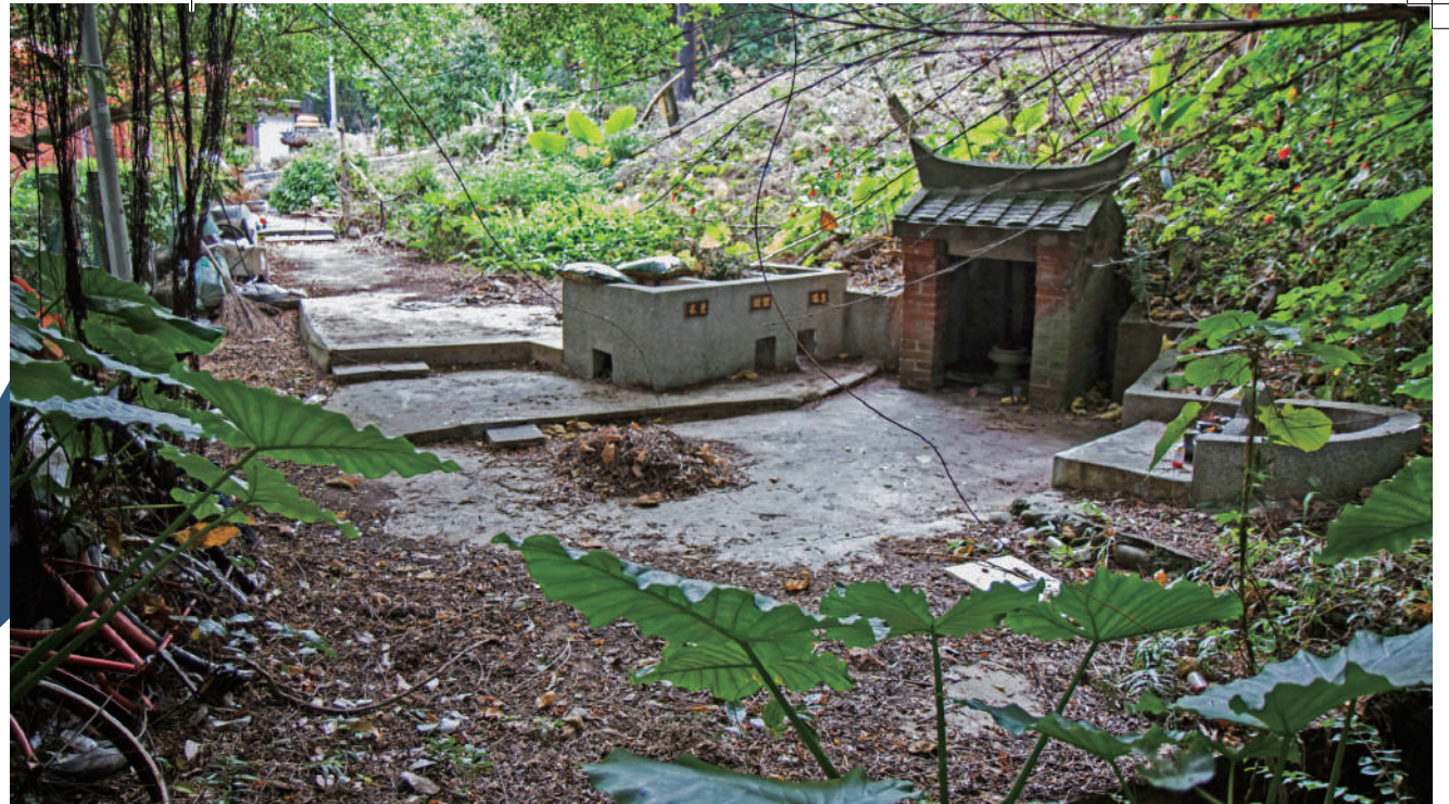
Shueichebian Wanshan Hall