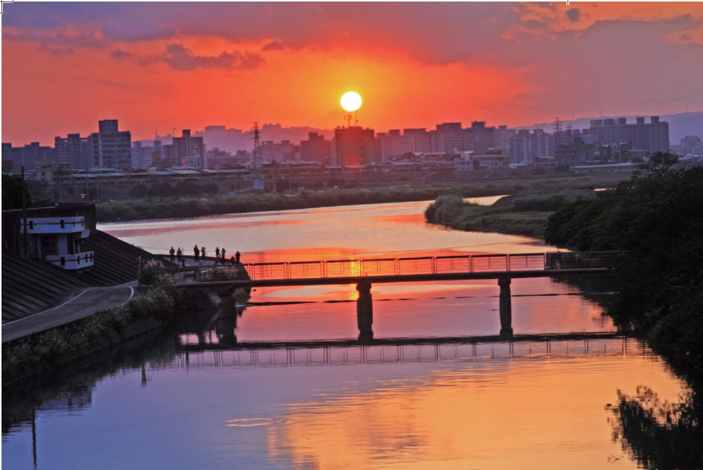
The new outlet of Waishuang River