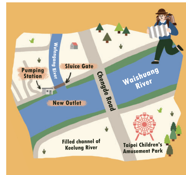
The appearance after Keelung River was straightened