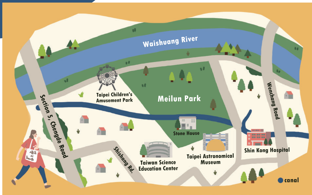
Fudeyang Canal comes to Zhouweitou

Zhouweitou was still a large area of farmland until 1973, with the Fudeyang Canal running through it. The urbanization here occurred quite late, most of the land outside of Meilun Street has been developed into "Meilun Park." (美崙公園) Since the filling of Keelung River, the inner bend became Jihe Road, this new land has added many cultural and recreational facilities, such as the Taipei Astronomical Museum. In addition, the Taiwan Science Education Center, originally located in the "Nanhai Academy" on Nanhai Road, has also been relocated here. The