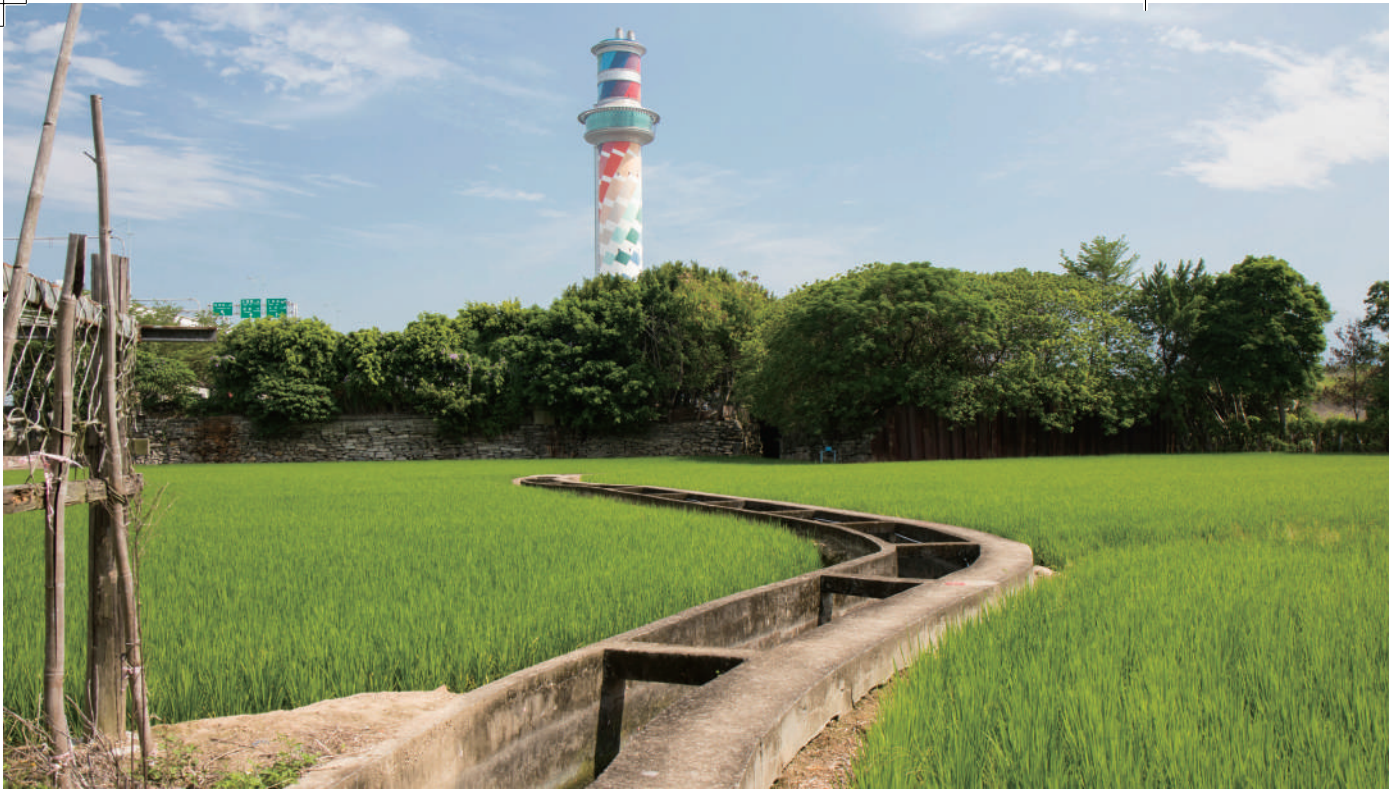
The paddy field around the final section of the Fudeyang Canal