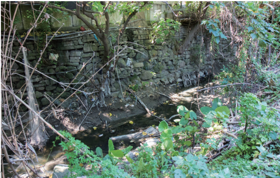
The old branch of Keelung River on the terrace