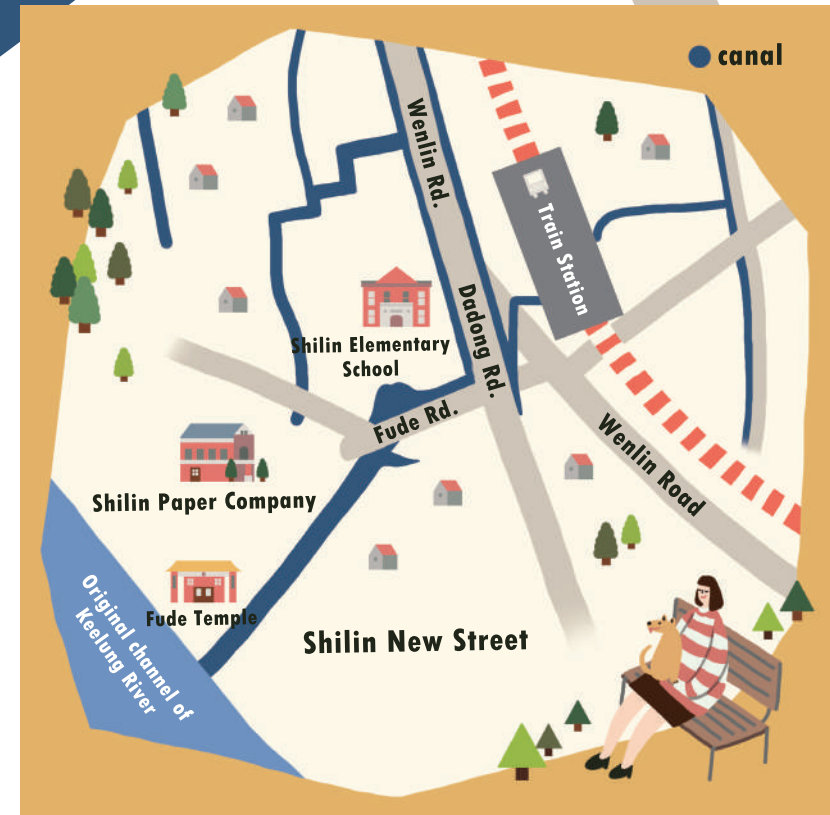
Fude Tzuen Small Canal and its surrounding area

The northern main branch from Wenlin Road and Meilun Street flows through the main entrance of Shilin Elementary School and connects to