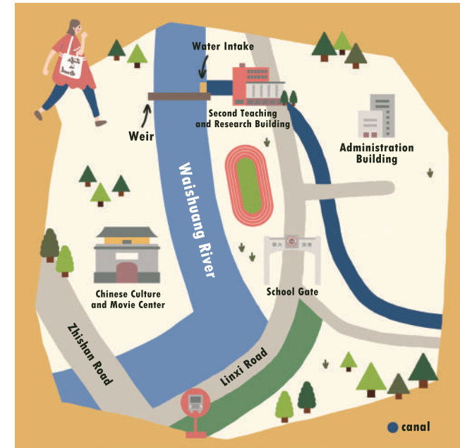
Map of the canal in Soochow University, Waishuanghsi campus

After leaving the school gate, there were several temporary houses built on this section of the water channel where small businesses were conducted, but now it has been sealed and covered into a hidden drain. Currently, there is only a small section of open water channel left outside the school gate.