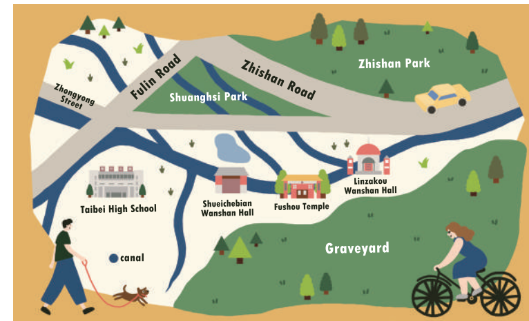
The Fudeyang Canal flows along Shuanghsi Park

Shuanghsi Park is a roughly two-hectare triangular area known for its natural Chinese-style garden with mountain and water landscapes. Its architecture is modeled after Chiang Kai-Shek’s homeland scenery, which once made it a must-visit destination in tourist routes of the National Palace Museum. It used to hold various flower exhibitions and was a popular filming location for movies and TV dramas, portraying it as a royal garden. However, with the construction of high-rise buildings near Shuanghsi Park, it is no longer suitable for film and TV productions. In addition, the park has been poorly maintained over time and has become a community park. Perhaps it no longer exudes a fairy-like aura, but it remains a small utopia amidst the bustling traffic.