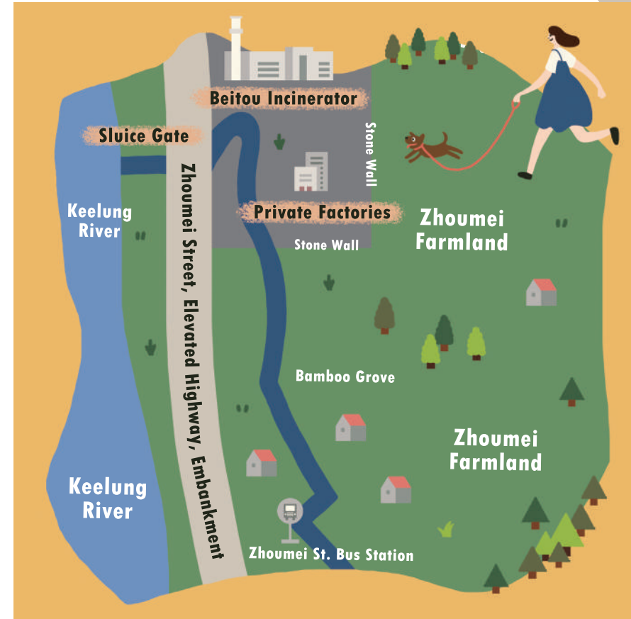
Map of the final section of the Fudeyang Canal

The old branch of the Keelung River in the factory area here is separated from the main channel of the Keelung River on the outside by the Zhoumei Street embankment and requires control by inner and outer sluice gates.