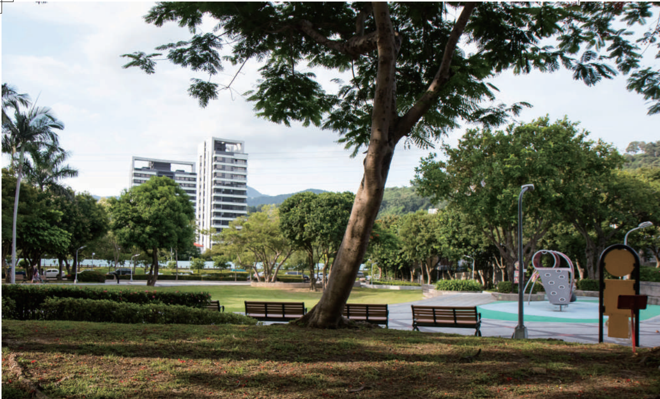
The Fuzhi Park