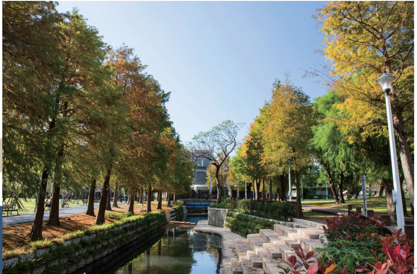
Fudeyang Canal water-friendly facilities at the side gate of Shilin Residence