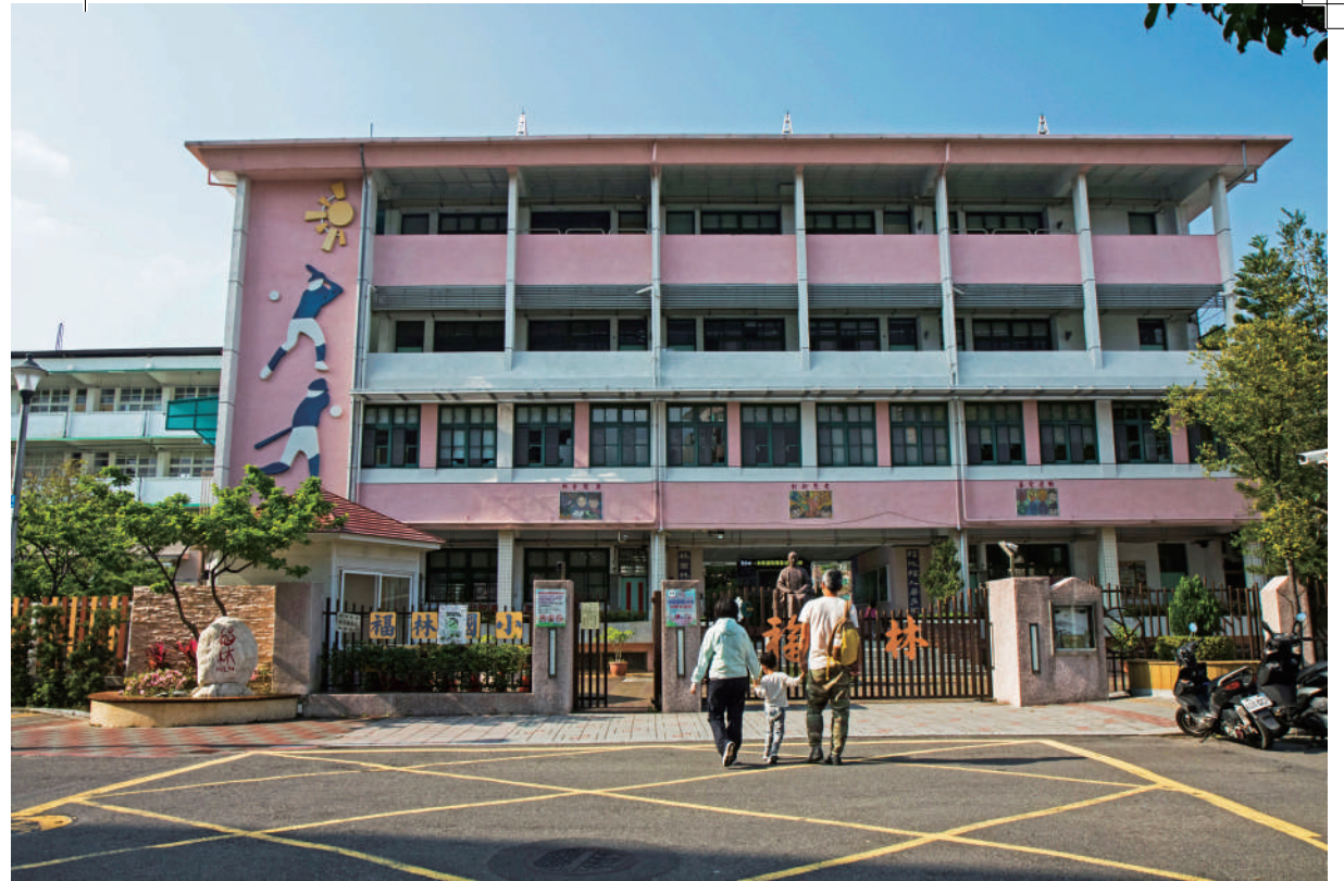
The northern main line passes through the back door of Fulin Elementary School