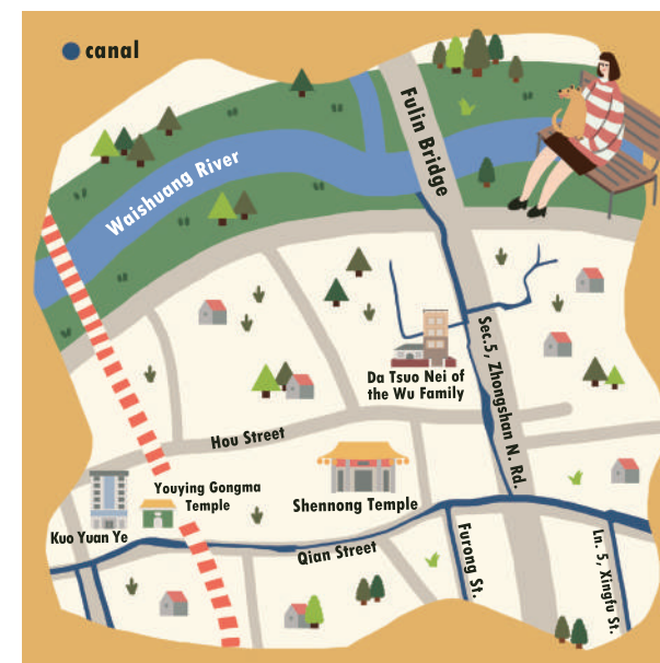
Fudeyang Canal passes in front of Shennong Temple, this area is called “Shilin Old Street”

The area around Shennong Temple is known as the Old Street, and the Youying Gongma Temple is a “ghost temple.” Although it was originally on the edge of the Old Street, it has now become the center of Shilin City. It is common to see residents and passersby worshiping and paying their respects. Although people change, some still continue to practice time-honored traditions. After passing the Youying Gongma Temple, Fudeyang Canal enters Meilun Street, which is always crowded and busy.