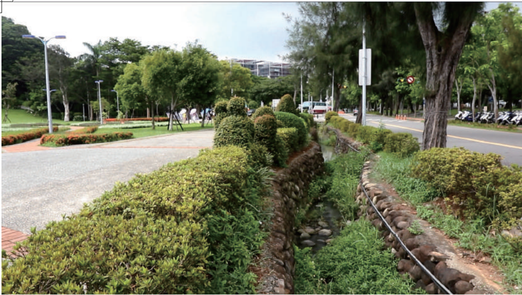
Fudeyang Canal outside the main gate of Shilin Residence