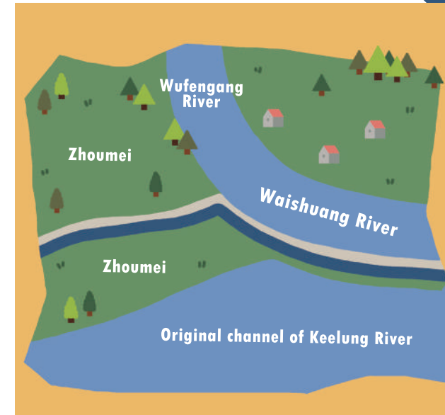
Fudeyang Canal used to run aside Waishuang River

At present, the Beitou Shilin Science and Technology Park is undergoing reconstruction, and as a result, the builders have demolished most of the old houses in the Zhoumei residential area, including single rooms, and courtyard houses such as Zhoumei Elementary School. These houses, which were nearly a century old, have been razed to the ground. The residents of Zhoumei Street have since moved into high-rise buildings where they were resettled.