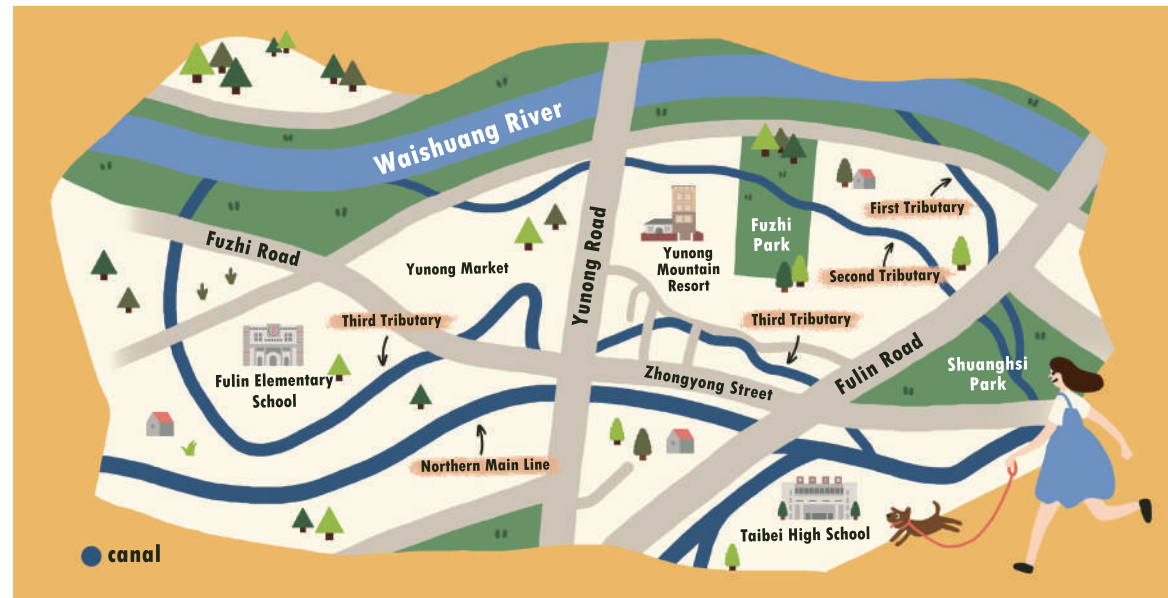
The three tributaries of the Fudeyang Canal at Shijouzi

Waishuang River, a tributary of the Keelung River (基隆河), originates from Neishuang River on Mt. Yangming's Qingtiangang area and the Jinghong Stream on Lengshuikeng. Each section was named differently in ancient times, once it reaches the Shilin Plain, the river is called "Shuanghsi" or "Lan Harbor." To avoid confusion with Shuanghsi District in New Taipei City, this book collectively refers to it as "Waishuanghsi." (外雙溪) It is important to note that the valley where Soochow University and the National Palace Museum are located was originally called "Waishuanghsi."