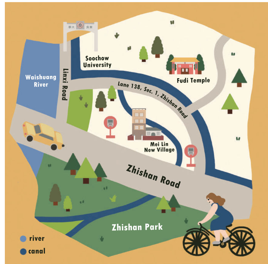
The Fudeyang Canal flows into Mei Lin New Village

When the Fudeyang Canal arrives at the intersection of Zhishan Road, it turns left on a diagonal, passing by some of the veteran’s village houses, flowing along the side of Zhishan Road towards the left side of Shuanghsi Park.