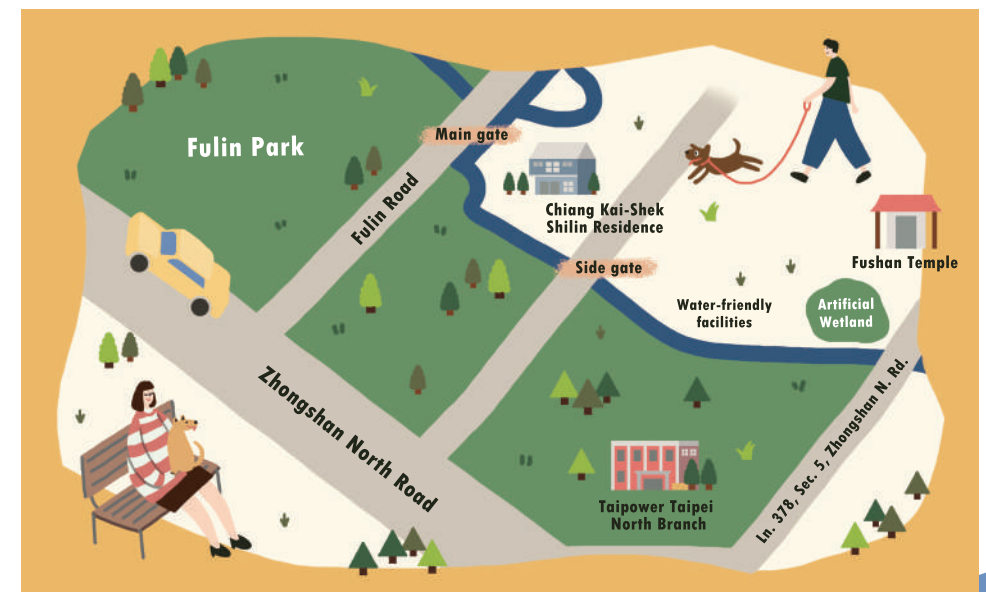
Fudeyang Canal flows through the main and side gate of Shilin Residence

The Chiang Kai-Shek Shilin Residence was originally the "Shilin Horticultural Experimental Station" established in 1908 during the Japanese colonial period in Taiwan. After the Nationalist government moved to Taiwan, it was renamed the "Chiang Kai-shek Official Residence" in 1950. After the passing of Chiang and the departure of his family, the residence was then managed by the Taipei City Government. In 2011, it was opened as the "Chiang Kai-Shek Shilin Residence Park" and has been very popular among Taiwanese and tourists.