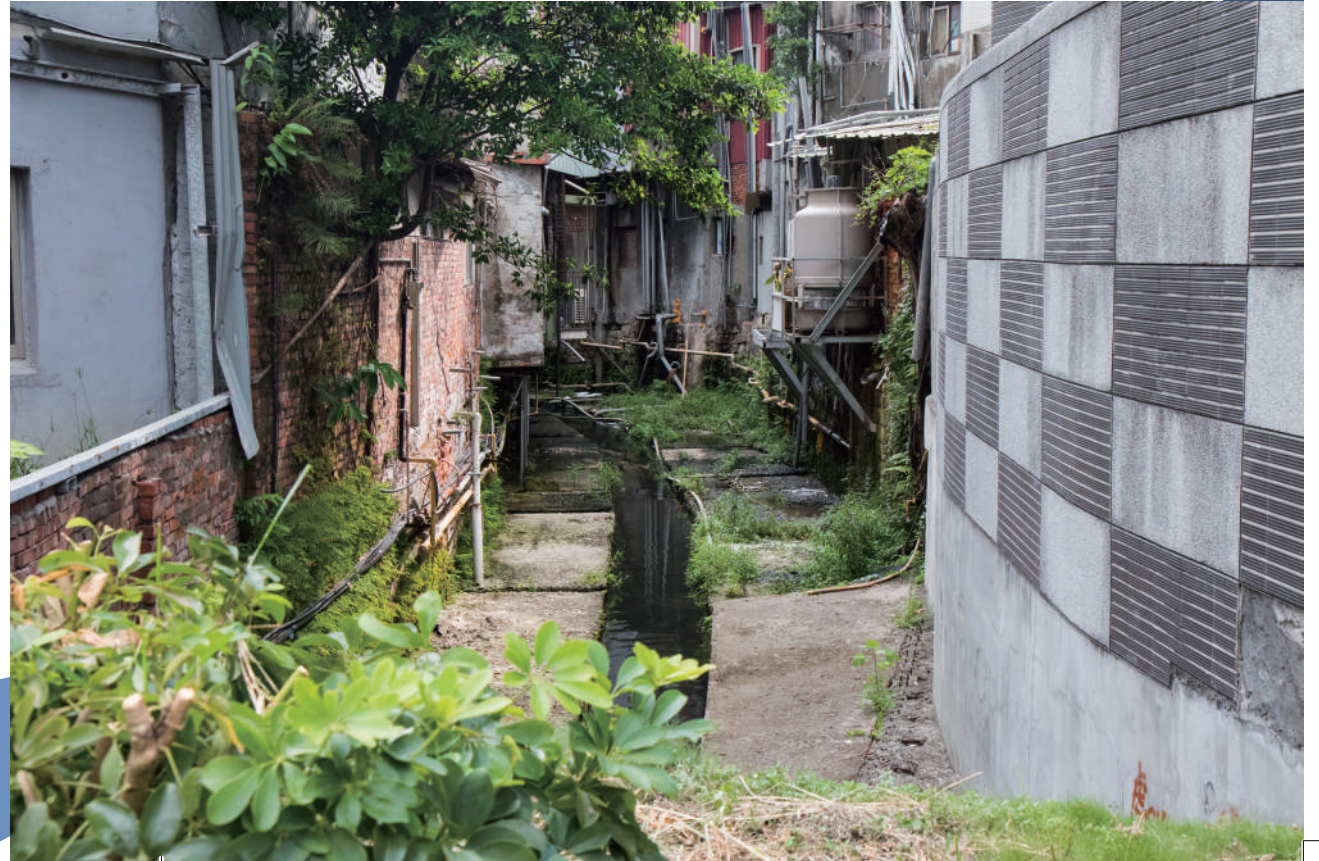
Fudeyang Canal flows across Lane 110, Wenlin Road