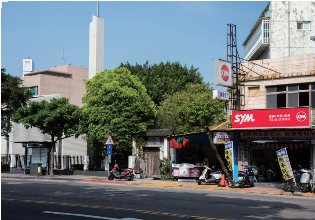
The northern main line passes through Fulin Road