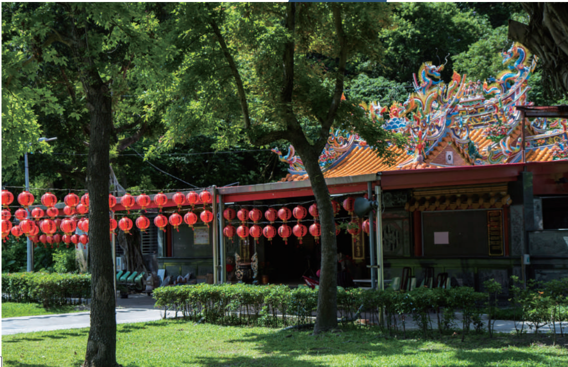
Shilin Fushou Temple