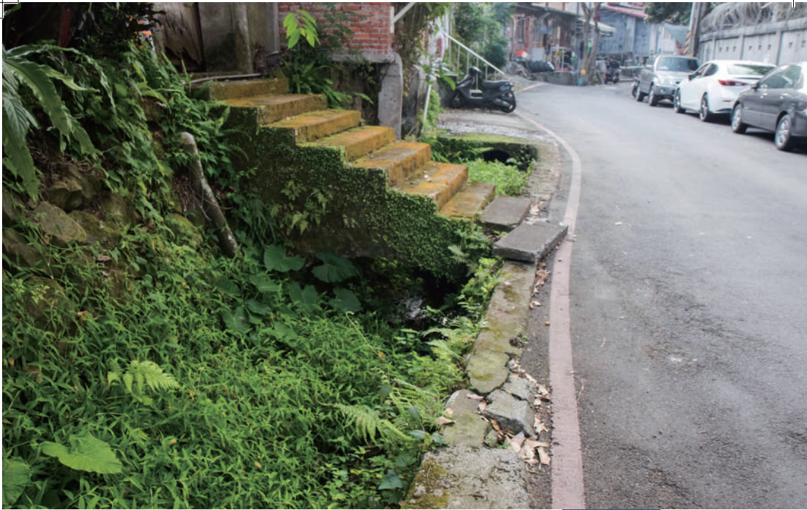
The Fudeyang Canal and the culverts