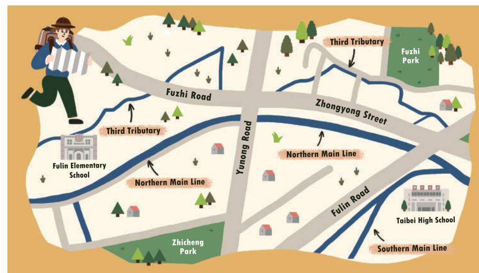
Map of Fudeyang Canal's northern main starting line

Next, the canal arrives at Fulin Elementary School (福林國小). This used to be the front gate, and today's playground used to be farmland. After Fuzhi Road was opened, the main gate of Fulin Elementary School was moved from the old alleyway to the spacious Fuzhi Road. The gate next to the canal was then changed to the back gate. The canal branches off nearby, flowing towards the main gate of Chiang Kai-Shek Shilin Residence (士林官邸) and connecting to the southern main line of Fudeyang Canal.