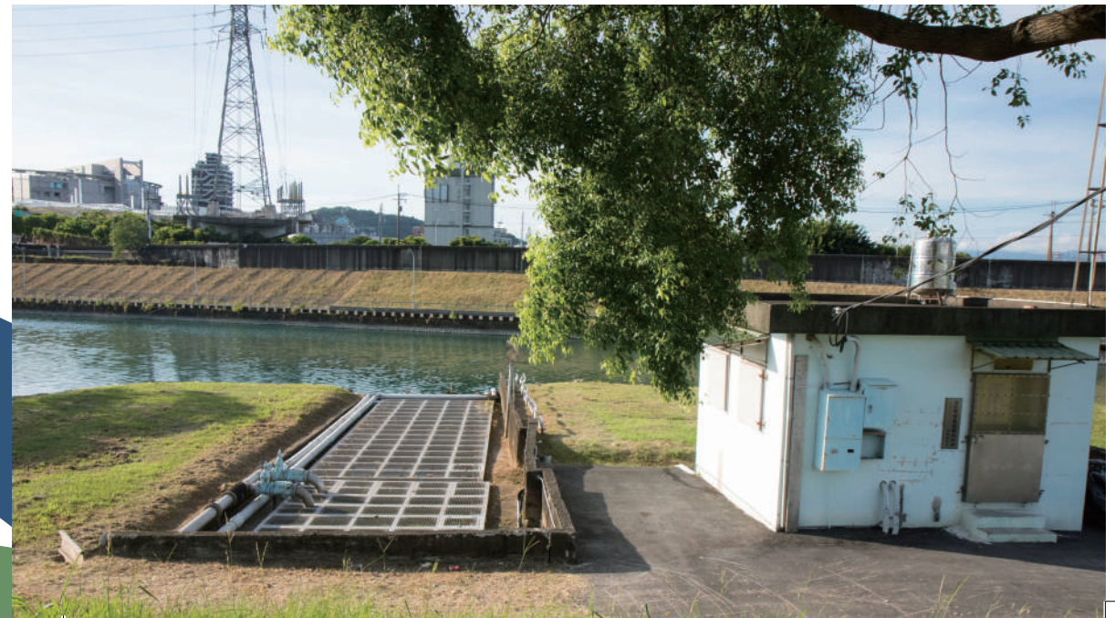
The pumping station next to the new outlet of Waishuang River, Zhoumei